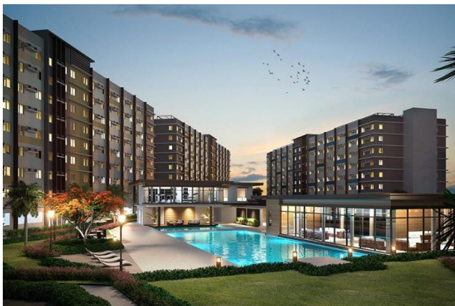
Futura One at Fora Dagupan, Pangasinan