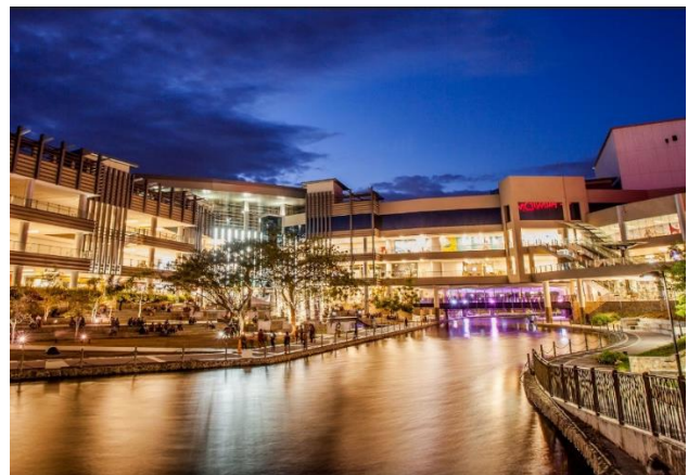
Festival Mall, Filinvest City, Muntinlupa

The company's mall business also grew by 66% compared to the same period last year and contributed Php 1.14 billion in revenues. The growth in mall revenues was due to the improvement in tenant occupancy and the increase in in-store sales brought about by increased foot traffic.